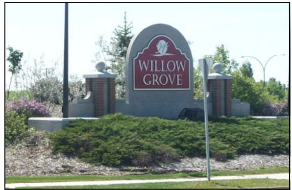
Willowgrove entrance monument

forms of neighbourhood development were encouraged, including a minimum average density of 5 units per acre, housing variety, neighbourhood commercial sites, infill development, affordable housing, and mixed uses in core neighbourhoods and formal industrial areas. Willowgrove tried to incorporate sustainable development principles in the neighbourhood design through higher density, and introduced new housing forms, neighbourhood commercial, and well-defined pedestrian areas.