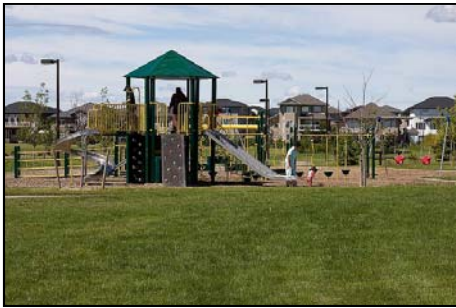
Playground in Wallace Park