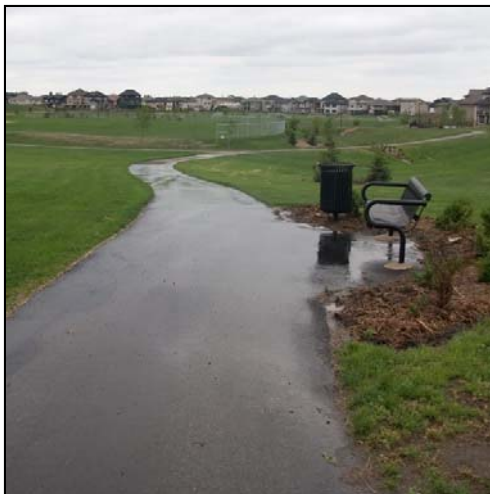
Pathways through parks increase connectivity