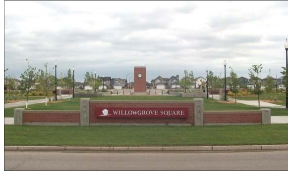
Future site of Neighbourhood Commercial