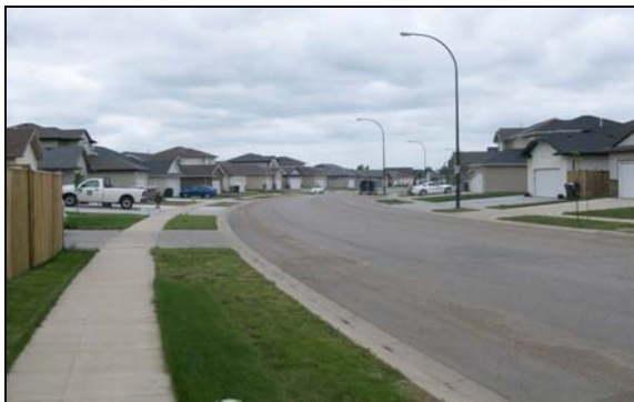
Sidewalks separate from road by grass buffer