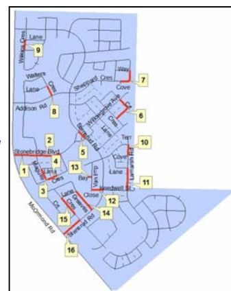
IMI Segments Map

from Crime. Twenty percent of street segments in each neighbourhood were randomly selected and observed. Each segment is the two facing sides of a street block and is indicated by a numbered flag on the map.