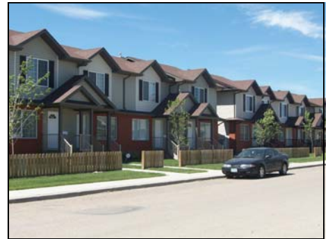
Repetitive architectural style

Willowgrove's attractiveness rating suggests that both attractive and unattractive features are present in the neighbourhood. For example, although two distinct architectural styles are present in different areas of the neighbourhood, the architectural aesthetic can appear repetitive. Further, no shade is available for pedestrians because street trees are too young. However, pleasant landscaping, linear park space, and nature features considerably increase the attractiveness of the neighbourhood.