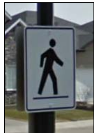
Pedestrian Crossing sign

Willowgrove's safety ratings suggest that pedestrian and vehicular travel areas are well defined and easy to safely navigate and that there are only a few elements that reduce feelings of personal security. For example, marked pedestrian crossings were only in place at the main intersections. However, sidewalks on many streets are separated from the road by a grass buffer strip. Further, the pathways through linear parks are designed for pedestrian travel that is completely separate from traffic. In terms of safety from crime, well maintained homes, minimal graffiti, and plenty of opportunities for casual surveillance of the street by home owners all contribute to the perception of personal security. However, there were some concealed areas in construction zones that could be used for lurking.