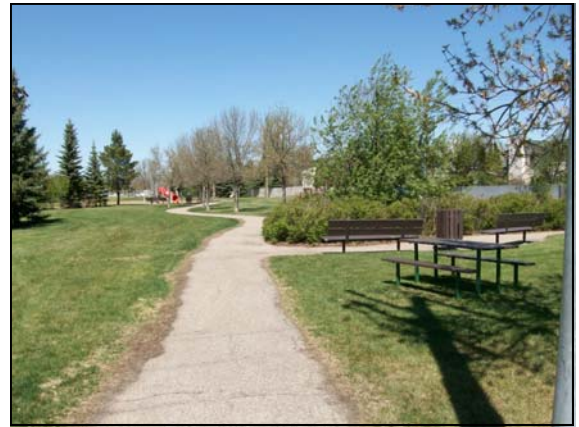
Picnic area and trails in W.J.L Harvey Park

Silverwood Heights' attractiveness rating suggests that both attractive and unattractive features are present in the neighbourhood. For example, street trees are present on many streets, providing partial shade for the sidewalk. Sidewalk amenities, such as benches or well-kept garbage cans, were only present in the parks. However, well maintained houses, pleasant landscaping, and the neighbourhood park considerably increase the attractiveness of the neighbourhood.