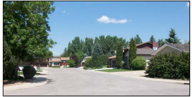
Silverwood Heights street view

by home buyers and therefore not incorporated into neighbourhoods developed during this period. Indeed, Silverwood Heights is predominantly single-family residential, although there are pockets of medium-density housing.