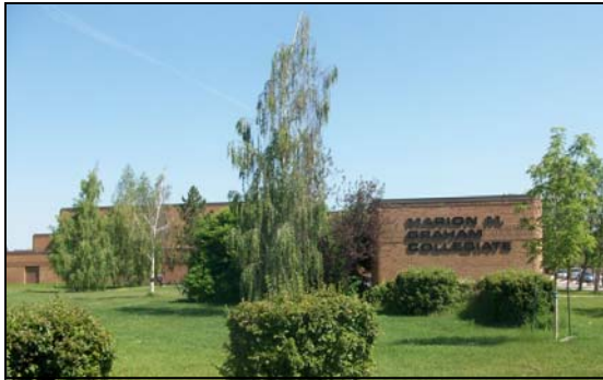
Marion M. Graham Collegiate

We rated each neighbourhood according to the number, diversity, and density of its destinations. These ratings suggest whether destinations in a neighbourhood can motivate deliberate, localized active living choices by providing a place to go and a means to interact with others.