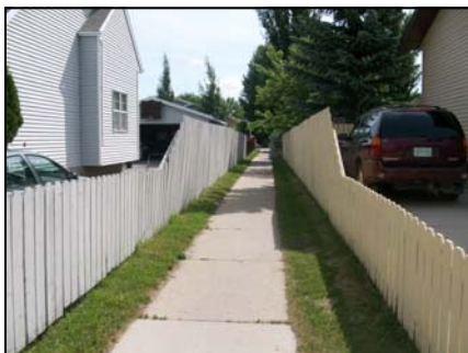
Pedestrian access way

These activity friendliness ratings suggest that Silverwood Heights has both supports and obstructions for pedestrians. For example, all observed streets have well-maintained sidewalks on both sides of the street. Further, wide streets provide adequate room for cyclists, and bike parking at the park considerably increases bike friendliness. The street design with several crescents and culs-de-sac limits the route choices and access for pedestrians and cyclists. However, pedestrian access ways in some areas join disconnected streets and increase route choice for pedestrians.