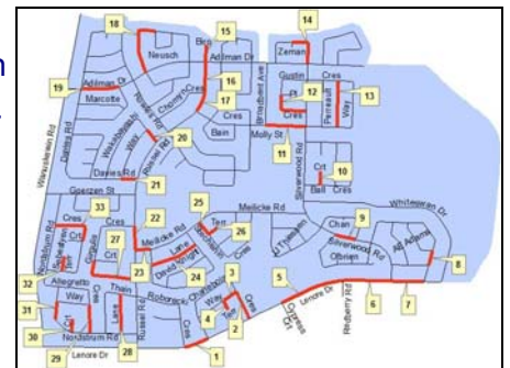
IMI Segments Map

The NALP tool is more subjective in nature and takes into account the impression of the entire neighbourhood based on the systematic observations of the researchers. In contrast, the IMI is more objective in nature and is based on observations of each individual segment. The following report will discuss how the characteristics of Silverwood Heights compare to Saskatoon neighbourhoods in general.