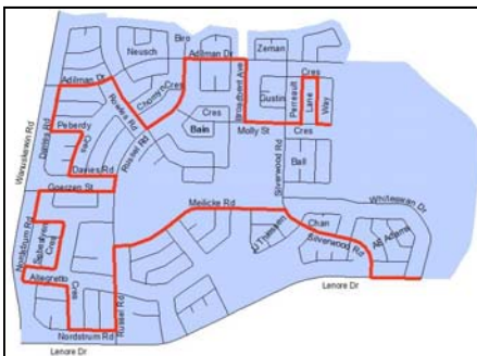
NALP Route Map

neighbourhood features within five areas: Attractiveness, Diversity of Destinations, Pedestrian Access, Safety from Traffic, and Safety from Crime. Twenty percent of street segments in each neighbourhood were randomly selected and observed. Each segment is the two facing sides of a street block and is indicated by a numbered flag on the map.