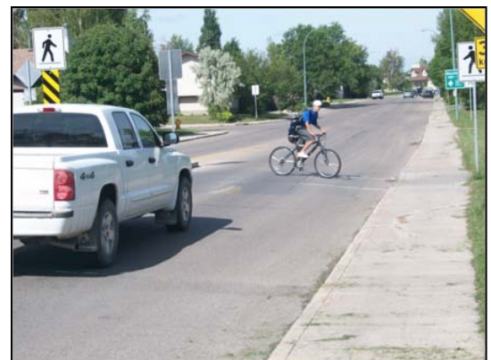
Active transportation in action

Silverwood Heights' safety ratings suggest that pedestrian and vehicular travel areas are well defined and fairly safe to navigate and that there are only few elements that reduce feelings of personal security. For example, few observed intersections were marked for pedestrian crossing, even though several observed streets had high traffic levels. Silverwood Heights could benefit from greater attention to the safety of pedestrians from traffic. In terms of safety from crime, well maintained homes, an absence of graffiti and concealed spaces for lurking, and plenty of opportunities for casual surveillance of the street by home owners all contribute to the perception of personal security.