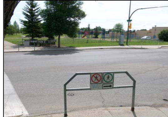
Crossing restricted at the playground