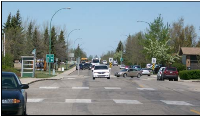
Well marked pedestrian crossing