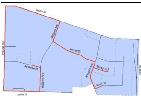
NALP Route Map

IMI consists of a 229-item inventory of neighbourhood features within five areas: Attractiveness, Diversity of Destinations, Pedestrian Access, Safety from Traffic, and Safety from Crime. Twenty percent of street segments in each neighbourhood were randomly selected and observed. Each segment is the two facing sides of a street block and is indicated by a numbered flag on the map.