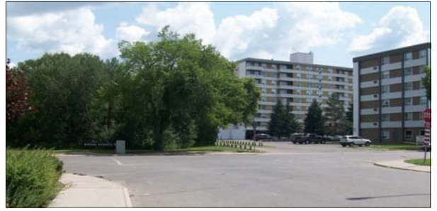
Nutana Suburban Centre street view

The Nutana Suburban Centre is bordered by Taylor Street, Circle Drive, Louise Street, and Preston Avenue. The Nutana Suburban Centre was designed under the First Community Planning Scheme, which was in effect from 1966-1982. This was Saskatoon's first comprehensive neighbourhood plan that sought to design neighbourhoods as independent communities. As such, each neighbourhood was required to develop around a school site and neighbourhood park, and park space became standardized at 10 acres per 1000 people. Commercial types became distributed into neighbourhood and suburban centre uses. Core neighbourhoods became the focus for high density and mixed-use while suburban neighbourhoods became primarily single-family residential. The Nutana Suburban Centre provides commercial destinations that are absent from surrounding neighbourhoods.