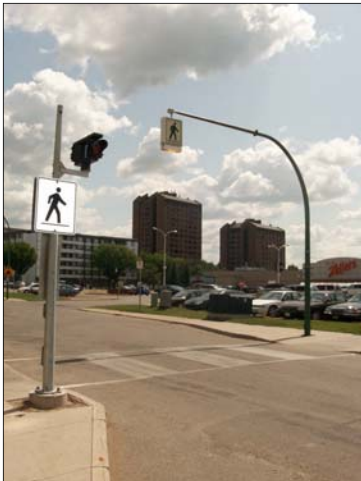
Well marked pedestrian crossing