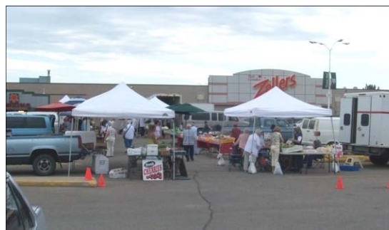
Outdoor Farmer's Market