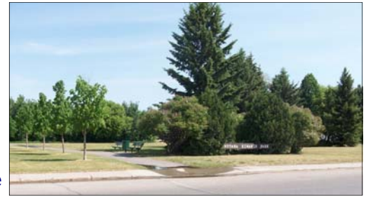
Nutana Kiwanis Park

We rated each neighbourhood based on specific features that could potentially increase or decrease the attractiveness of the neighbourhood. This rating suggests whether the level of attractiveness for each neighbourhood itself can encourage or discourage individuals to participate in an active lifestyle.