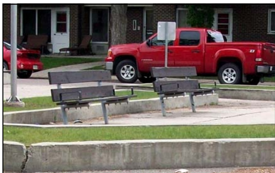
A place to rest while walking

These activity friendliness ratings suggest that the Nutana Suburban Centre has both supports and obstructions for pedestrians. For example, most streets have a least one sidewalk, and when present, sidewalks are in good condition. Further, wide streets provide adequate room for cyclists though heavy traffic limits the route choices. High density residential located close to destinations enables many residents to easily access destinations using active transportation.