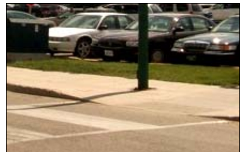
Graded curb cut

We rated the universal accessibility of each neighbourhood according to the presence or absence of specific features that help or prevent safe movement for those with mobility, visual, or hearing impairments. These ratings suggest whether people with reduced mobility are able to travel in the neighbourhood safely without assistance.