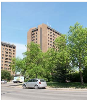
High density near destinations