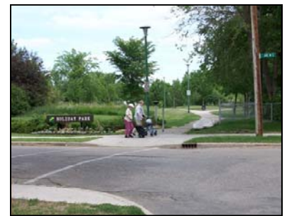
Curb cuts provide access for people with reduced mobility

We were able to rate the universal accessibility of each neighbourhood according to the presence or absence of specific features that help or prevent safe movement for those with mobility, visual, or hearing impairments. These ratings suggest whether people with reduced mobility are able to travel in the neighbourhood safely without assistance.