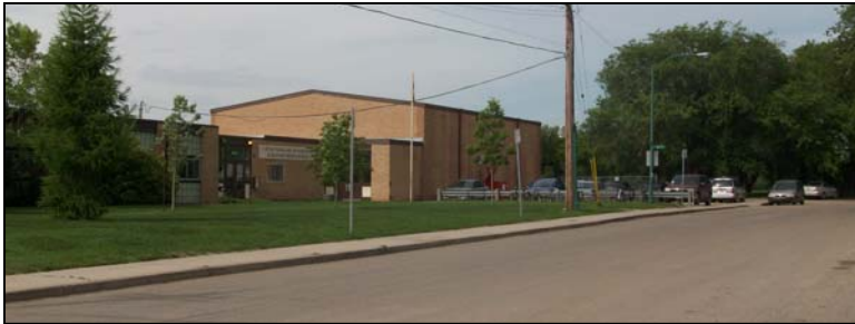
No marked pedestrian crossing in front of Saskatoon French School