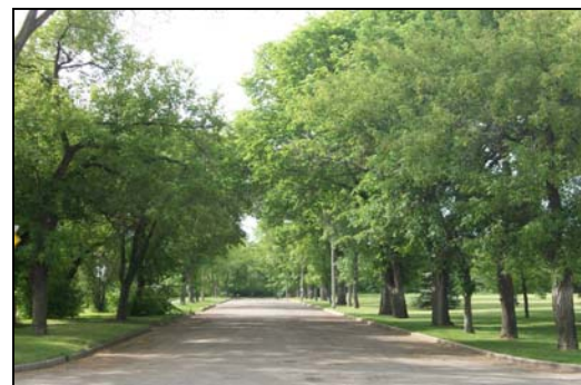
Wide streets support cyclists