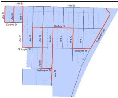
NALP Route Map