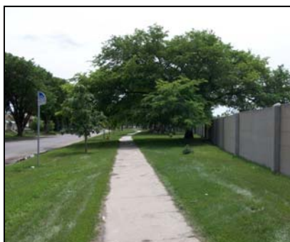
A pedestrian and bike path

These activity friendliness ratings suggest that Holiday Park has both supports and obstructions for pedestrians. For example, most streets have a least one sidewalk, and when present, sidewalks are in fairly good condition. Wide streets provide adequate room for cyclists, but bike parking was absent from most destinations. The grid street pattern is easy to navigate and provides a wide range of route choices pedestrians and cyclists.