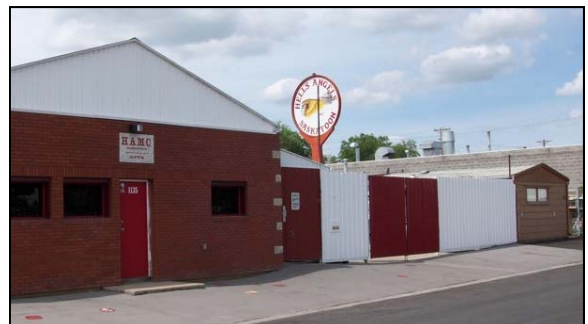
Hell's Angels Clubhouse

Holiday Park's high safety ratings suggest that pedestrian and vehicular travel areas are well defined and easy to safely navigate and that there are few elements that reduce feelings of personal security. For example, although several observed intersections were uncontrolled and few were marked for pedestrian crossing, traffic levels were quite low, so observers felt most streets were safe to cross. However, some key areas were missing crosswalks, such as nearby schools. In terms of safety from crime, well maintained homes, plenty of opportunities for casual surveillance of the street by home owners, and no observed graffiti all contributed to the perception of personal security.