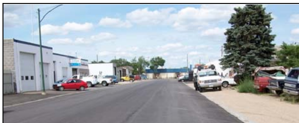
Light industrial uses

Holiday Park's destination ratings suggest that there are some destinations of a limited variety. For example, observed destinations in Holiday Park include two schools, churches, a neighbourhood park with playing fields and a playground, some light industrial uses, nearby sports facilities, and a campground.