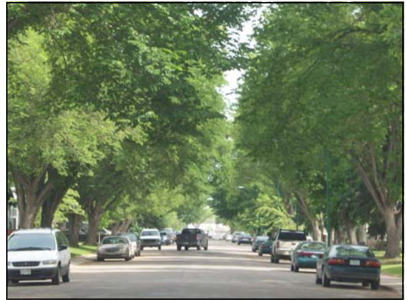
Holiday Park street view

Neighbourhoods developed under the First Zoning Bylaw often included early forms of curvilinear streets, where grid patterns give way to crescents linked by a collector street. Holiday Park, however, is composed entirely of grid patterned streets.