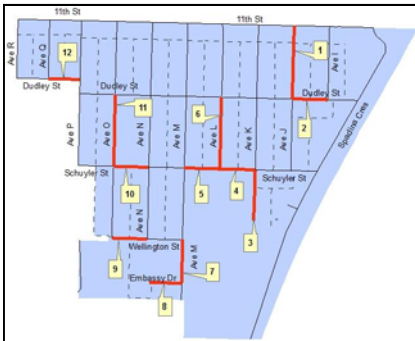
IMI Segments Map

NALP consists of 22 items within four areas: Activity Friendliness, Safety, Density of Destinations, and Universal Accessibility. Using this method, observers rated each item on a 6-point scale after walking a pre-defined route in each neighbourhood that connected 10 randomly-selected street segments. The route, typically 4 to 5 kilometres in length, is shown in red on the map.