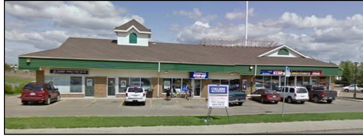
Dundonald Strip Mall

We rated each neighbourhood according to the number, diversity, and density of its destinations. These ratings suggest whether destinations in a neighbourhood can motivate deliberate, localized active living choices by providing a place to go and a means to interact with others.