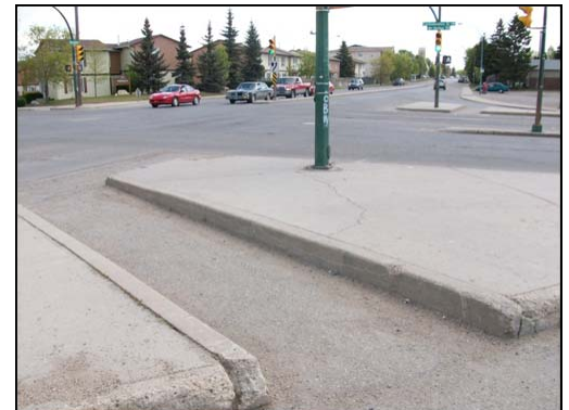
A street level passage provides universal access to this pedestrian refuge.

We rated the universal accessibility of each neighbourhood according to the presence or absence of specific features that help or prevent safe movement for those with mobility, visual, or hearing impairments. These ratings suggest whether people with reduced mobility are able to travel in the neighbourhood safely without assistance.