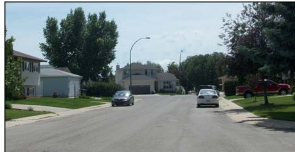
Wide streets are supportive of cyclists

We rated the activity friendliness of each neighbourhood based on specific features that encourage or present barriers to an active lifestyle. These ratings suggest whether a neighbourhood assists or limits the opportunities for physical activities such as walking, cycling, or skateboarding.