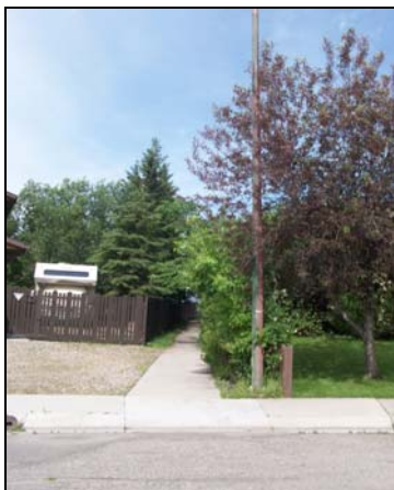
Pedestrian access way

These activity friendliness ratings suggest that Dundonald has both supports and obstructions for pedestrians. For example, all observed streets have sidewalks on both sides of the street. Further, wide streets provide adequate room for cyclists, and bike parking at the park considerably increases bike friendliness. The street design with several crescents and culs-de-sac limits the route choices and access for pedestrians and cyclists. However, pedestrian access ways in some areas join disconnected streets and increase route choice for pedestrians.