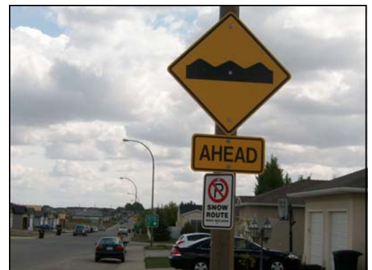
Speed Bump sign

Dundonald's safety ratings suggest that pedestrian and vehicular travel areas are fairly well defined and moderately safe to navigate and that there are only few elements that reduce feelings of personal security. For example, most observed intersections were not marked for pedestrian crossing, even though many observed streets had high traffic levels. Speed bumps and other traffic calming measures were in place in some areas to slow down traffic. However, Dundonald could benefit from greater attention to the safety of pedestrians from traffic. In terms of safety from crime, well maintained homes, an absence of graffiti and concealed spaces for lurking, and plenty of opportunities for casual surveillance of the street by home owners all contribute to the perception of personal security.