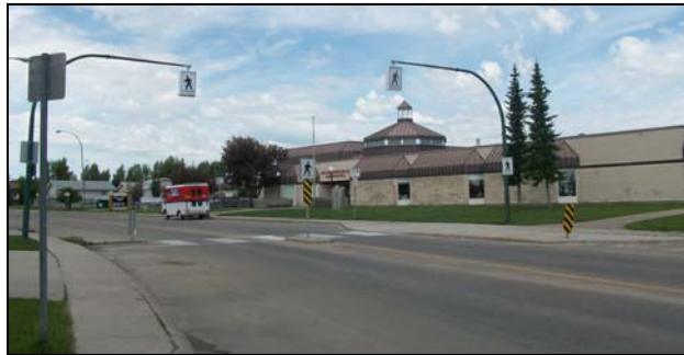
Well marked crosswalk in a School Zone