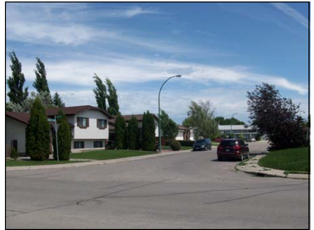
Dundonald street view

Dundonald is bordered by 37th Street, Junor Avenue, 33rd Street, and Hughes Drive. Dundonald was designed under the Municipal Development Plan of 1982. This plan focused on low-density development and separated single-family homes from all other forms of land use except parks, churches, and schools in order to protect property values. Development of high density, mixed-use, and neighbourhood commercial was not supported by home buyers and therefore not incorporated into neighbourhoods developed during this period. Indeed, Dundonald is predominantly single-family residential, although there are pockets of medium-density housing.