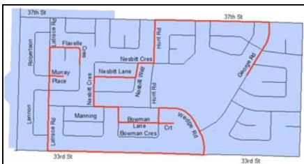
NALP Route Map

NALP consists of 22 items within four areas: Activity Friendliness, Safety, Density of Destinations, and Universal Accessibility. Using this method, observers rated each item on a 6-point scale after walking a pre-defined route in each neighbourhood that connected 10 randomly-selected street segments. The route, typically 4 to 5 kilometres in length, is shown in red on the map.