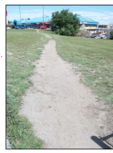
No defined pedestrian area where pedestrians frequently travel

Features such as this large sign and parking lot are oriented more towards vehicles than pedestrians